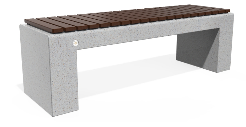
Logo Stainless Steel: